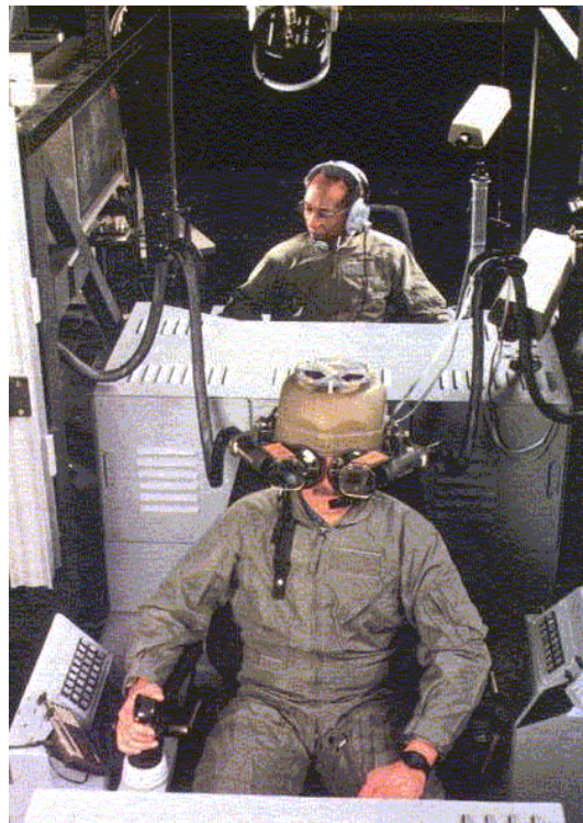
Figure 4: Research Simulator Applied for Designing the New Combat Helicopter [2].

In the process of designing the new combat helicopter the research simulator shown in the Fig. 4 has been used.