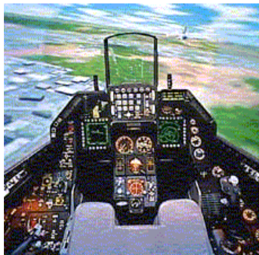
Figure 7: F-16 MLU Cockpit Optimised in NLR Research Simulator.

Research works have been conducted on the newly designed aeroplane cockpit version built on top of the simulator motion base, replacing original simulator cockpit. Other modules of the simulator: motion system, visualisation system, instructor-researcher station, computer system were used for that project purposes. The range of research was smaller than in the previous example. New cockpit and control systems were designed outside of the simulator and initially tested with the use of other methods. Research done on the simulator goal was optimising the new cockpit from the human factor point of view. So, systems were modelled up to the subsystems level and layout of the cockpit equipment was analysed. In fact, some layouts initially chosen before these tests were evaluated in the conditions of simulated environment and missions very similar to the real ones. Missions tested with the use of simulator were limited to the standard for that aeroplane.