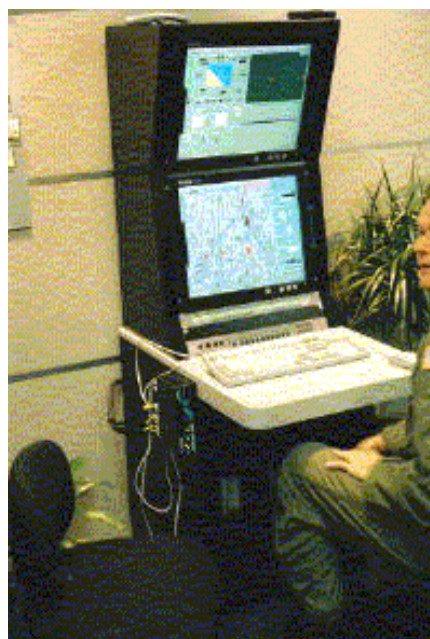
Figure 2: X-45 UCAV Ground Control Station.