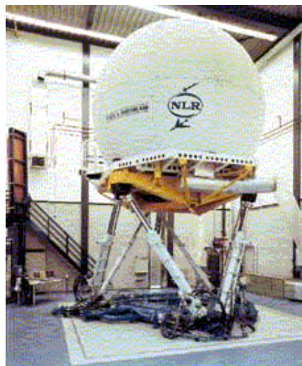
Figure 5: NLR Research Flight Simulator [3,4].

The main goal of that project was the new cockpit for upgraded (MLU – Mid Life Upgrading) version of the combat aeroplane F-16 E/F. The final stage of the design and test works has been performed on the research flight simulator (see Fig. 5, 6, 7) located at NLR facility [3,4].