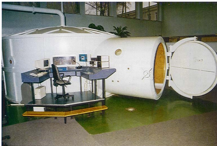
Figure 11: One of the Hypobaric Chambers at Polish Air Force Institute of Aviation Medicine.

Hypobaric chamber shown in the Fig. 11 allowed for training military pilots and accustoming them for low pressure environment but also for testing equipment supporting military pilot operations.