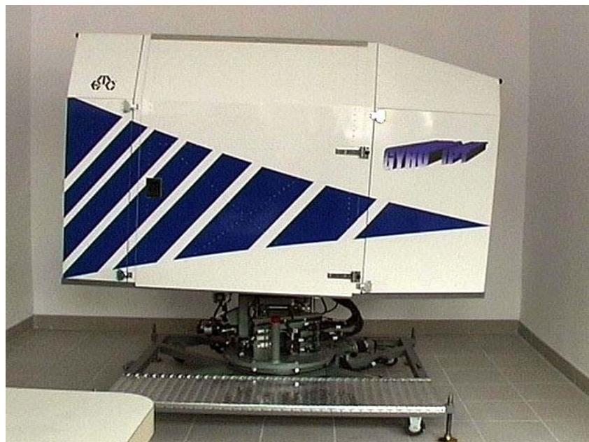
Figure 9: "Gyro IPT" Disorientation Training Device at Polish Air Force Institute of Aviation Medicine.

Device shown in the Fig. 9 is being used not only for research but also for presentation and training military pilots in disorientation during the flight. It is equipped with fiberoptic transmission lines allowing for introducing any measuring equipment into the test during the simulated flights.