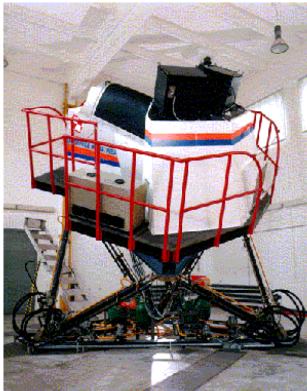
Figure 8: "Japetus" Research Flight Simulator at Polish Air Force Institute of Aviation Medicine.

Device shown in the Fig. 9 is being used not only for research but also for presentation and training military pilots in disorientation during the flight. It is equipped with fiberoptic transmission lines allowing for introducing any measuring equipment into the test during the simulated flights.