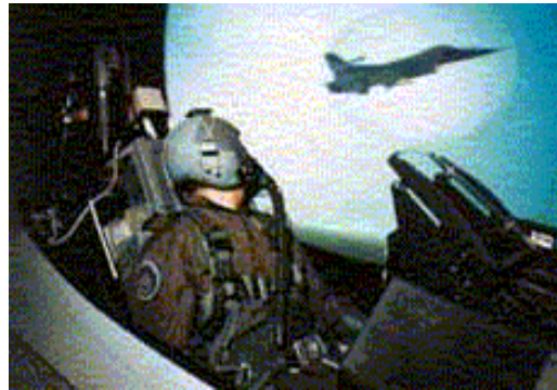
Figure 6: F-16 MLU Cockpit Optimised in NLR Research Simulator.