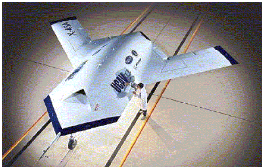
Figure 1: X-45 Unmanned Combat Aerial Vehicle.

Increasing requirements on reliability and safety of flying caused automation of the bigger and bigger number of tasks and actions performed by the human-operator up to that time. In military aviation, the modern battlefield high requirements on speed and precision of combat tasks performance caused, that human-operator became the weakest element of the aeroplane flight control loop. One can expect that because of these reasons in the battlefield we could meet unmanned combat vehicles in the near future (see Fig. 1). The nearest ones will be controlled by the human-operator from the ground (see Fig. 2) and the next fully automatic, able to perform all the tasks totally in autonomic mode.